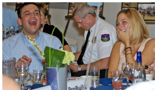
Auction guests bidding on live items

It is because of our community's amazing support that all auction proceeds will go directly to support our mission of building decent, affordable homes in partnership