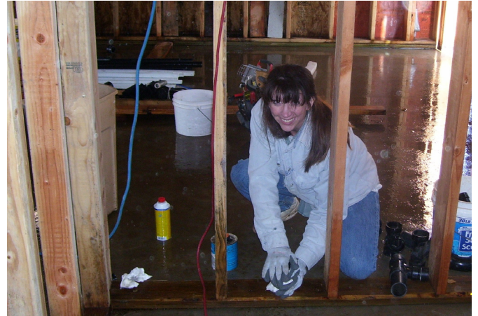
This will be my new home!